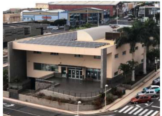
Adeje's municipal music school, with a 99.9-kWp rooftop PV installation, is the hub of the first energy community in the municipality

The fundamental concept is that a larger PV site (99.9 kWp) on the rooftop a municipal building in Adeje serves as the community's hub. This model will also be evaluated in the event that private community members would like to install their own assets. The residents of the community use the public grid to collectively consume the energy generated by the assets located inside the community. Community members also receive a financial benefit, i.e., reduction in the network fees and tolls, for the electricity supply from the low voltage power grid.