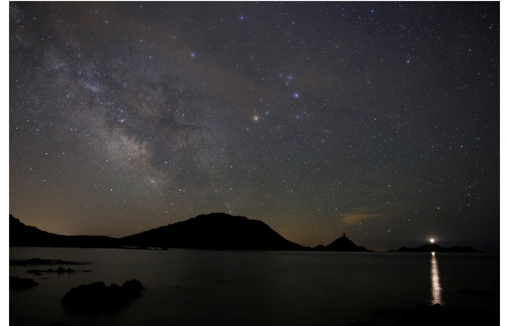
Quality of the night sky in Ajaccio's area