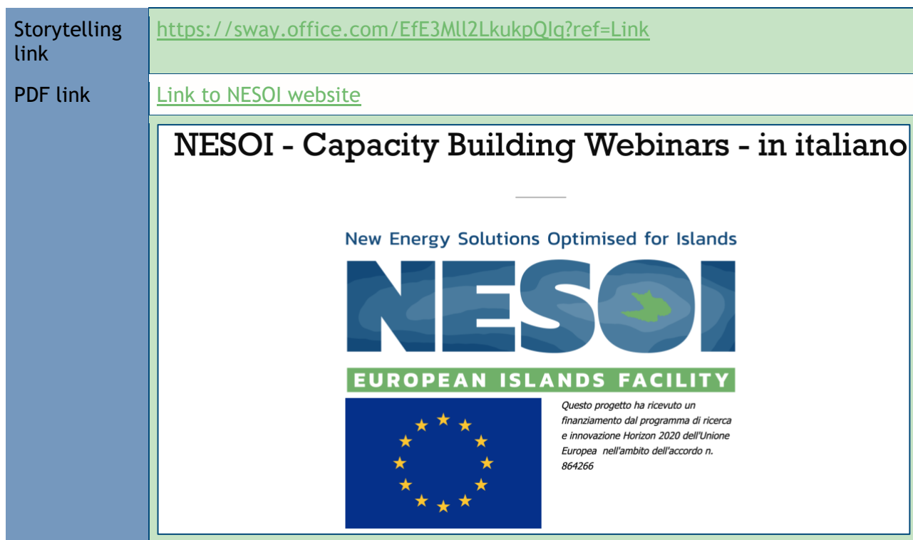
Figure 2. Italian: NESOI Storytelling experience