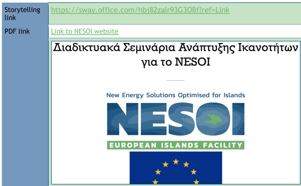
Figure 4. Greek: NESOI Storytelling experience