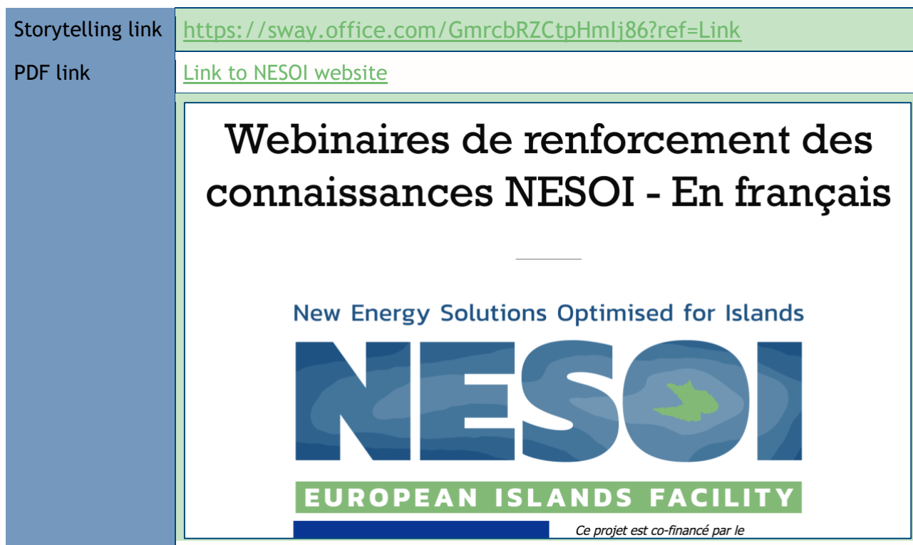
Figure 5. French: NESOI Storytelling experience