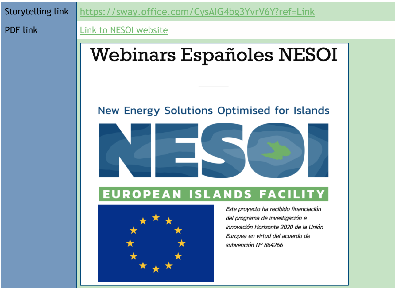
Figure 3. Spanish: NESOI Storytelling experience