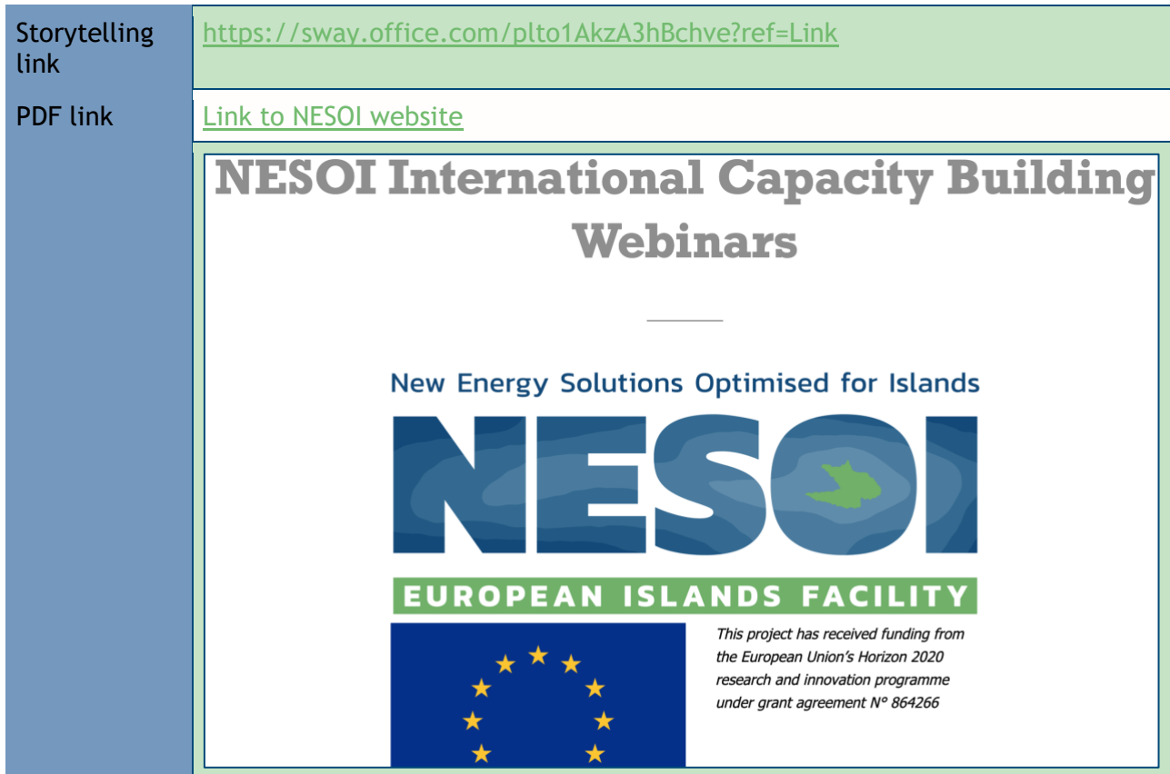
Figure 1. International: NESOI Storytelling experience